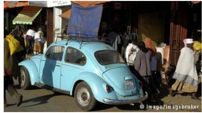
Many of the cars in Addis Ababa are old and heavy polluters

Addis Ababa has grown rapidly in a short time, doubling in size over the past 15 years. A quarter of Ethiopia's population lives here. That's 3.3 million people. The city's growing population is placing huge pressure on infrastructure. A further problem is air pollution. The city is full of old, inefficient cars, factories spew smoke skyward and most homes use wood to cook and heat.