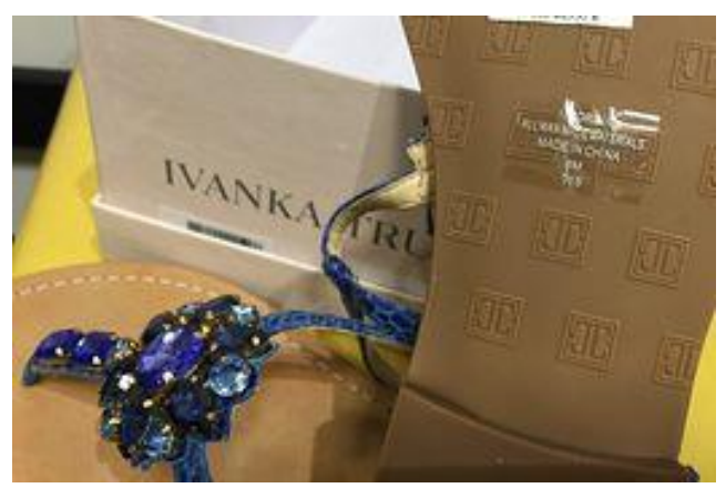
Ivanka Trump sandal, stamped Made in China. Bloomingdale's, NY

"Neither locale means jobs in the good ol' USA. And it's a question: Can Trump's father and Republican candidate for president Donald Trump bring jobs back to the United States? Trump has talked about undoing bad trade agreements with China and Mexico.