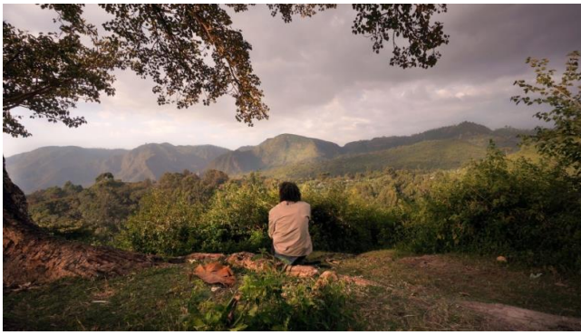
Scene from Shashamane

Shashamane, about the Rastafarian community in the town of the same name, south of Addis Ababa, was screened at the Ritzy, Brixton on 1st November. The UK premier of Roaring Abyss , "a musical road movie which takes the viewer across Ethiopia, a nation of eighty different languages. Full of field recordings of all forms of traditional music, traditional pieces, using scales different from Western music" was screened on 5th November.