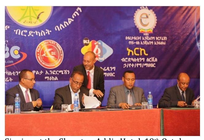
Signing at the Sheraton Addis Hotel, 19th October

The transition will improve quality of transmission. Producing the boxes in Ethiopia contributes to technology transfer and allows the product to be sold in the country at an affordable price.