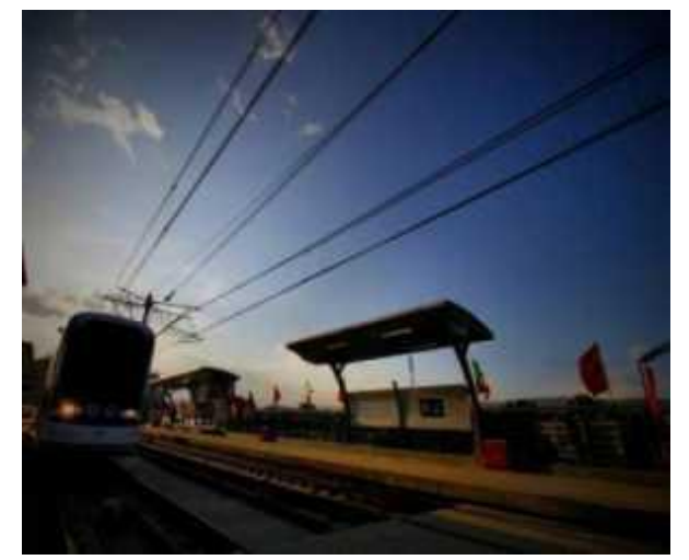
Ethiopia's light railway opened this autumn

Under GTPII, the Ethiopian Road Construction Corporation (ERCC) will boost the government's market share in road construction to 50%. Its new business plan will also support an increase in the government's role in road maintenance from its current share of nearly 55% to 70%. ERCC is currently engaged in 13 federal road construction projects, and local and private contractors are involved in 54 projects. ERCC looks forward to laying down 1,600 km roads under GTPII when the new business plan permits international companies to work jointly with ERCC. "Our efficiency will improve through time; we are aware that we face several problems and we will do our best under GTPII to solve these problems," a spokesman said.