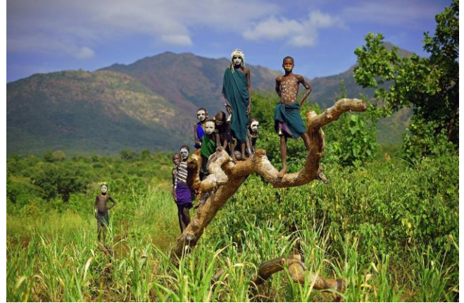
Photo: Children from the Suri tribe pose in Ethiopia's southern Omo Valley region near Kibbish on September 25, 2016

More pictures at <a href="https://goo.gl/BGuzhd">https://goo.gl/BGuzhd</a>