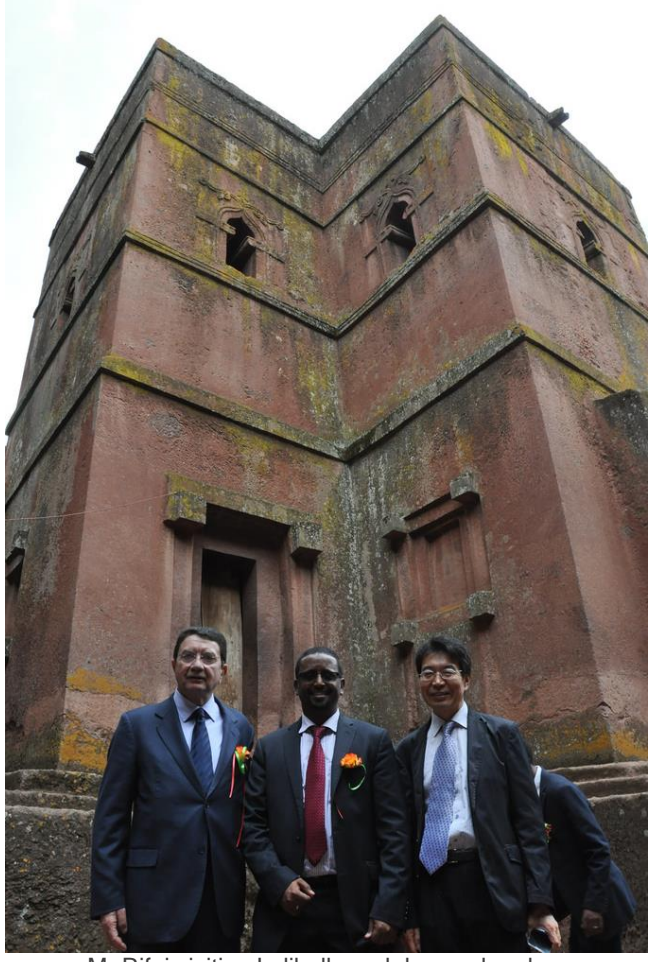
Mr Rifai visiting Lalibella rock-hewn churches

Ethiopia a top destination in Africa", said Mr Desalegn.