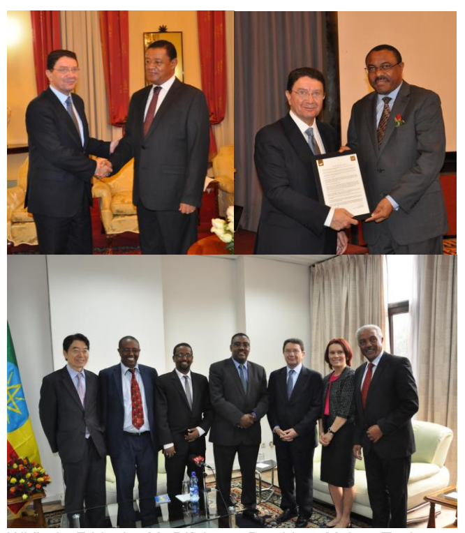
While in Ethiopia, Mr Rifai met President Mulatu Teshome, Prime Minister Hailemariam Desalegn, Deputy PM Demeke Mekonnen, Minister of Culture & Tourism Amin Abdulkadir and the Ethiopian Tourism Organisation

development. "Tourism is a key tool to lift people out of poverty and create new opportunities", he said. "The steps being taken by Ethiopia - enhancing the protection and conservation of tourist attractions, expanding tourism infrastructure, establishing a tourism marketing organization and a national tourism council and increasing tourism education and training institutions, will surely make tourism a pillar of the development of Ethiopia", he added.