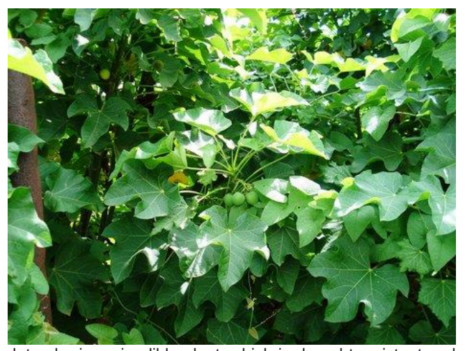
Jatropha is an inedible plant, which is drought resistant and contributes to natural resource conservation as it can grow on depleted land

500 million litres of biodiesel will be produced from the expansion of Jatropha plantations in Ethiopia following a 5-year Jatropha development project aimed at transplanting 700 million seedlings.