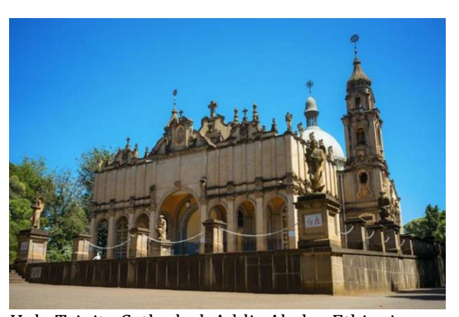
Holy Trinity Cathedral, Addis Ababa, Ethiopia.

Head to this buzzing city to experience Ethiopia's rich culture and traditional crafts. Visit the National Museum where prehistoric fossils are on display. When in Addis Ababa, drink a macchiato at Tomoca Coffee, share a plate of injera, and soak into the Ethio jazz scene.