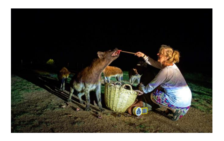
Best Trips 2018 is featured in the December/January 2018 issue of Traveler magazine, now available on newsstands and online at NatGeoTravel.com/BestTrips2018.

FUN FACT: Hyenas are welcome night visitors in Harar, where they eat food waste and are fed by 'hyena men.'