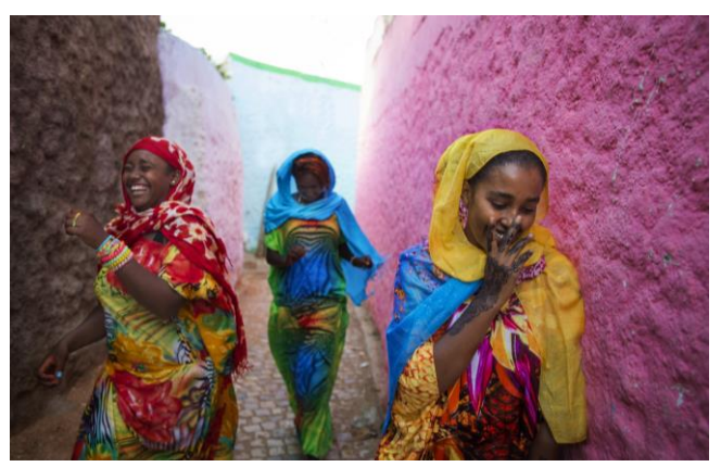
Harar's old town is a maze of alleys lined with colourful walls.

The "most surprising city in East Africa", Harar was selected for its cultural aspect. The "City of Saints" boasts 82 mosques, as well as Ethiopia's best beer and highest quality coffee.