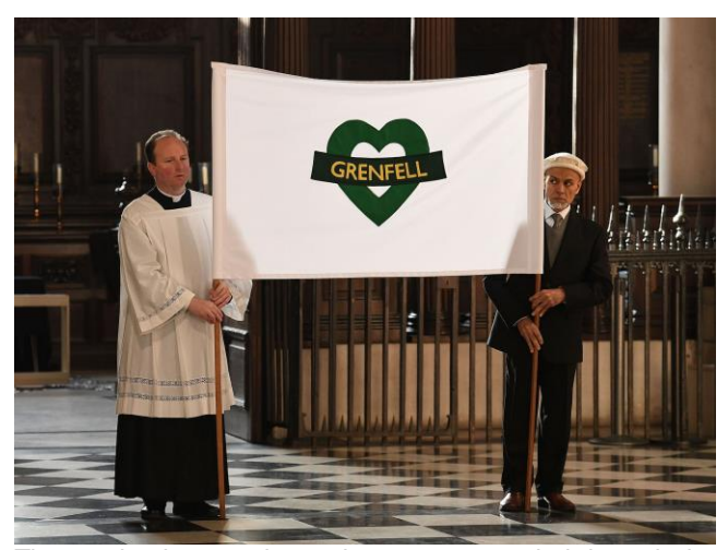
The service began when a banner was carried through the congregation to the pulpit by a Catholic priest and Muslim cleric

The multi-faith service included performances and messages of support for the bereaved, offering strength and hope for the future. A pre-recorded montage of voices from the local community was also played during the service.