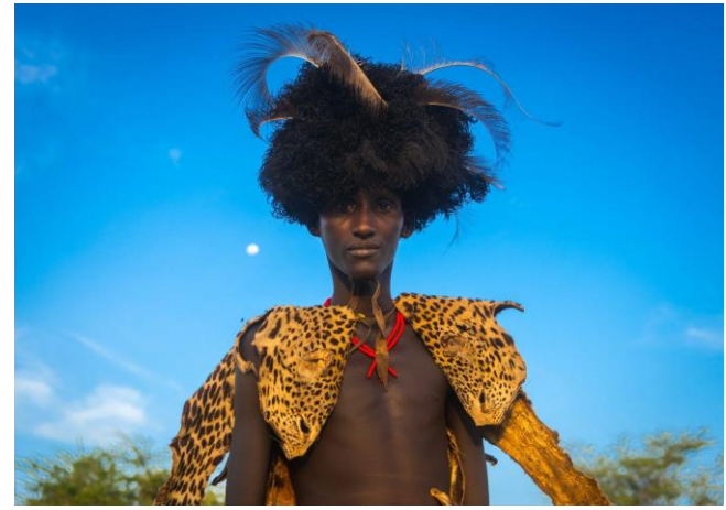
Dassanech man during dimi ceremony to celebrate circumcision of teenagers, Omo valley, Ethiopia

"In the south, tribes like Nyangatom, Dassanech, Mursi, Hamer and Bodis still live a traditional way of life, with very beautiful ceremonies. In the north are the Afars who are nomads."