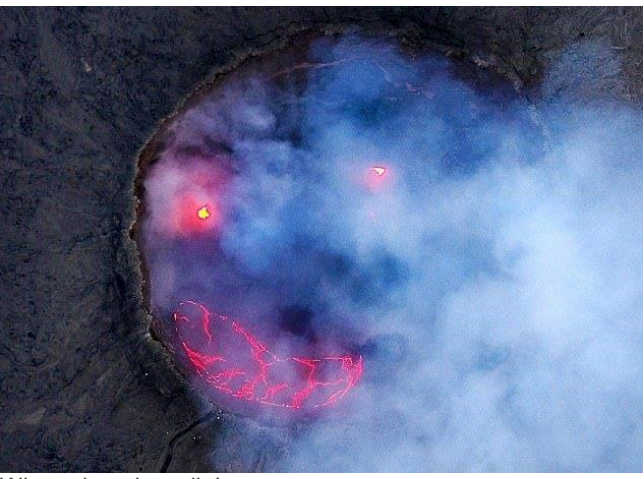
What a lava-ly smile!

Temperatures at the Danakil Depression reach as high as 60 degrees.