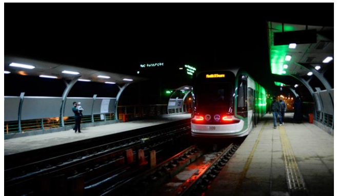
The Addis Ababa Light Rail Transit

Commissioned in September 2015, the Addis Ababa Light Railway is the first of its kind in Africa built at a cost of $475 million.