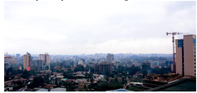
View of Addis from the Restaurant

Center Point Addis Restaurant, the first revolving restaurant in Addis Ababa with a panoramic view of the capital, opened on 24th August.