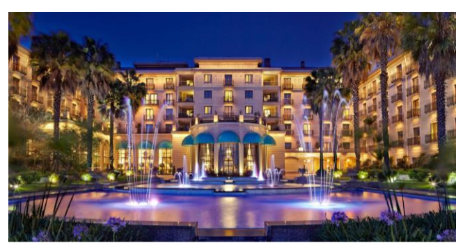
Sheraton Hotel Addis Ababa

This boost to the hospitality sector will generate more foreign earnings and the hotel sector will benefit from an increase in the number of inbound travellers with the expected opening of some international hotel brands. Five international hotel brands are currently under construction.