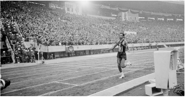
Abebe Bikila breaks the tape as he crosses the finishing line to win the Men's Marathon race on 21 October 1964 during the Olympic Games at the National Stadium in Kasumigaoka, Shinjuku, Tokyo, Japan.

In October 1964, Tokyo hosted their first Olympic Games. To celebrate, Tokyo 2020 is highlighting some of the most incredible and historic moments that took place 56 years ago, among them is Abebe Bikila, the Ethiopian marathon runner who glided through the streets to claim gold.