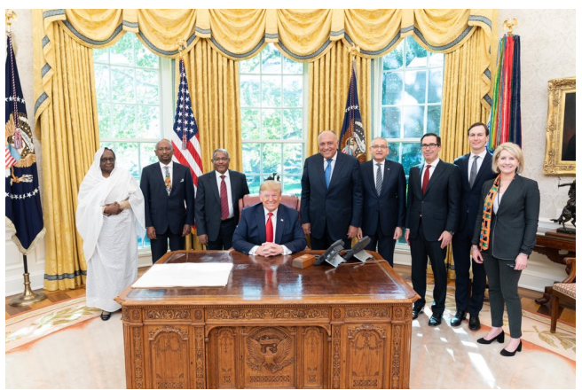
File Photo: The delegations with President Trump in November 2019

The Foreign and Water Affairs Ministers of the three countries and their delegations, consisting of legal and water technical experts, took part in the talks.