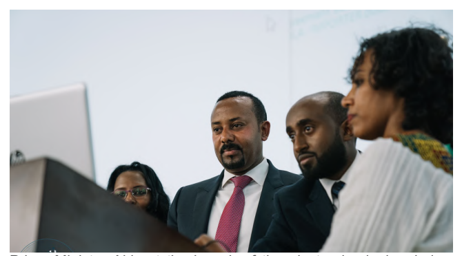
Prime Minister Abiy at the launch of the electronic single window project

"The system would help to facilitate trade as well as provide efficient and fast services to clients," she said.