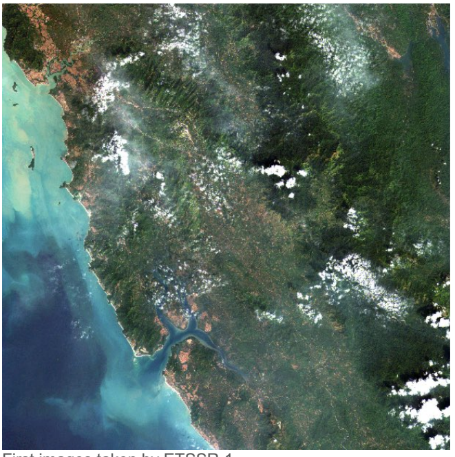
First images taken by ETSSR-1

According to experts, the satellite would contribute a lot in gathering beneficial information, and alleviate Ethiopia's dependency on other countries for information.