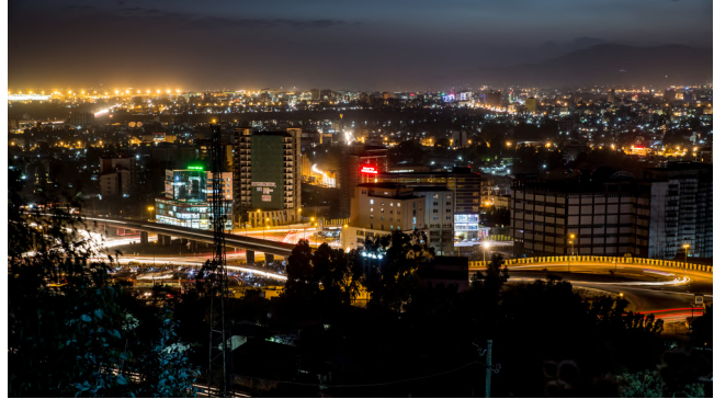
Addis Ababa at night

Last year in January, Ethiopia overtook Dubai as the transfer hub for long-haul travel to Africa.