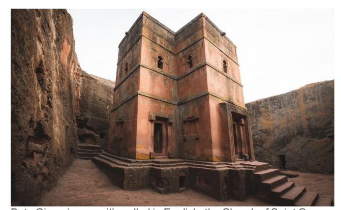
Bete Giyorgis or, as it's called in English, the Church of Saint George, is perhaps the most famous one dating back to the turn of the 13<sup>th</sup> century

North of the capital, you'll find the eleven rockhewn churches of Lalibela, also sometimes referred to as the eighth wonder of the world.