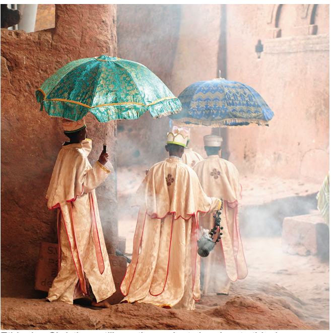
Ethiopian Christians still use the ancient churches to this day

"All across the complex is a sea of white against the pink rock as Ethiopian Orthodox Christians wrapped in robes and shawls pray with palms upturned, joining the priests in songs and incantations. Drumbeats reverberate hypnotically around the site and frankincense fills the air. The sense of devotion is enveloping."