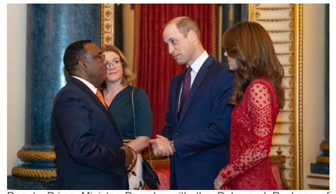
Deputy Prime Minister Demeke with the Duke and Duchess of Cambridge at Buckingham Palace

The reception was also attended by The Earl and Countess of Wessex, the Princess Royal, African Heads of State and Government and a number of British and African Business leaders.