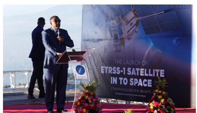
Deputy Prime Minister Demeke speaking at the launching ceremony

This will be a foundation for our historic journey to prosperity,' Deputy Prime Minister Demeke Mekonnen said in a speech at the launch.