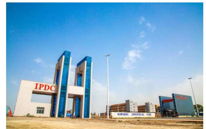
Hawassa Industrial Park

The Hawassa industrial park, launched earlier this year, helped the town to create more jobs.