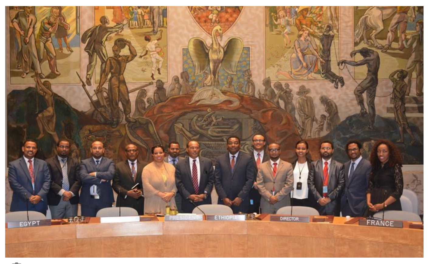
Ambassador Tekeda Alemu with his team at the UN Headquarters

Ethiopia has concluded its presidency of the United Nations Security Council for the month of September.