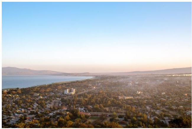
Hawassa city skyline

According to fDi Intelligence, Ethiopia's Hawassa is the top city for Foreign Direct Investment jobs in the Middle East and Africa.